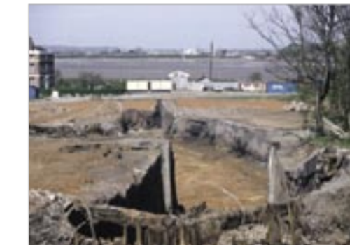
Looking down through the lower locks

The Runcorn Locks Restoration Society was formed in 2004 with the aims of campaigning for the Runcorn Old Line of locks to be restored. This will reinstate the link between the end of the Bridgewater Canal in Runcorn and the Manchester Ship Canal. The link will create a second Cheshire Ring with the beautiful River Weaver and historic Anderton Boat Lift as part of the route.