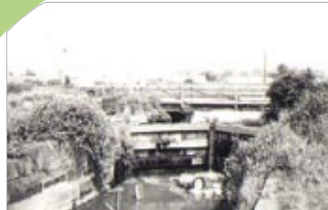
Fiddlers Ferry lock in the 1970s

Authorised in 1755 as the canalisation of Sankey Brook, the Sankey Canal was in fact built as an entirely artificial navigation adjacent to the brook; the first of its kind in the UK when it opened in 1757. Running initially from the coalfields of St Helens to the River Mersey at Sankey Bridges, it was extended in 1762 to Fiddlers Ferry, near the current power station, and later, in the 1830s, further extended to Widnes where it enters the Mersey just upstream of the Runcorn-Widnes 'Jubilee' Bridge at Spike Island.