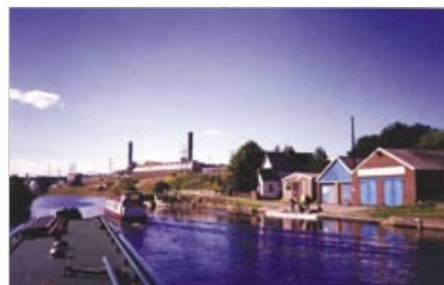
Clifton Rowing Club, Rocksavage

The Weston Canal, part of the Weaver Navigation, runs through Halton to docks at Weston Point. Thomas Telford helped to complete this link to the Mersey, bypassing the now derelict Frodsham lock, which is currently the subject of a restoration project, started by the River Weaver Navigation Society.