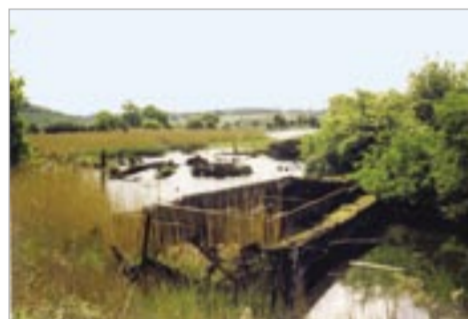
The boat graveyard at Sutton Level Locks

The scenic River Weaver rises in the Peckforton Hills and flows via Nantwich, Winsford and Northwich into the Mersey Estuary between Frodsham and Runcorn. It passes through a beautiful landscape, with only occasional pockets of industry. The river was made navigable with 11 locks from Frodsham to Winsford in 1732 to serve the salt industry. Success led to widening and deepening over the next 150 years and the number of locks was reduced to four.