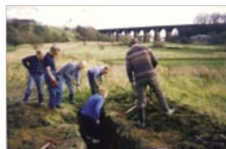
Newton Common Lock

One of the most unusual developments in recent years has been the proposed link from the Sankey to the Leeds & Liverpool Canal, which would, for the first time, create a direct connection to the main waterway system. A number of alternative routes have been put forward and the feasibility of each is currently being investigated. There is little doubt that a fully 'connected' canal would encourage far more people to use the Sankey for various leisure activities, particularly given the Pierhead Link scheme currently underway on Liverpool's waterfront.