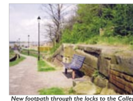
New footpath through the locks to the College

What the society needs to be able to show potential fund holders is that there is a widespread desire to see the locks restored and to achieve this we need your help. By joining the R.L.R.S. (at the modest fee of five pounds per year) you will help us keep up the momentum already achieved. Our efforts have already moved the project higher up the local authority's priority list and with more support from a wider community we can give the scheme an even bigger boost. PLEASE HELP. JOIN US TODAY.