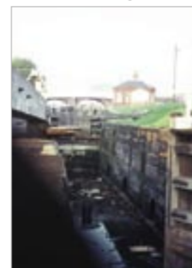
Runcorn top lock

The Duke built a home for himself at the foot of the proposed lock flight (now part of the College campus) and superintended the construction of the five pairs of locks below where Waterloo Bridge now stands, which were opened in 1773. Trade was brisk for many decades and with the development of the extensive Runcorn Dock system, which later developed into the Runcorn & Weston Canal, a second flight of locks was built, heading west from Waterloo Bridge, south of the original line.