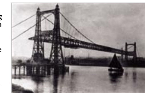
The old Transporter Bridge

The abiding image of Halton for many people is the Runcorn-Widnes 'Jubilee' Bridge, which spans the River Mersey between the borough's two principal towns at Runcorn Gap. Built in 1961, it succeeded the Transporter Bridge that had been built in 1905 to replace a ferry. But barely a stone's throw from the bridge, the Sankey Canal enters Widnes along the river's north shore. The Bridgewater Canal and the Manchester Ship Canal meet at Runcorn Docks, while a little to the south, the Weaver Navigation gradually shakes off its rural aspect as it skirts round Runcorn Hill to Weston Point.