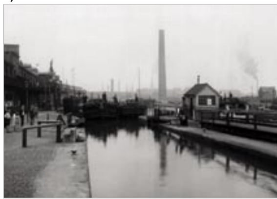
Widnes Lock in its heyday

The Halton length of the canal is sandwiched between the towers of the Fiddlers Ferry power station to the east and that of the award-winning Catalyst chemical museum on West Bank. Between them, Spike Island is a major local attraction; moored yachts and cruisers which have replaced the Mersey flats that used to serve Gossages soap works and Hutchinson's chemical works. Other features include the rudder from one of the old flats, the preserved wet dock, which was the world's first man-made railway dock, and the visitors' centre run by the council's Ranger service. From almost all of the Halton towpath, and from the trails round Spike Island, there are extensive views across the river to Daresbury, Norton and Runcorn.