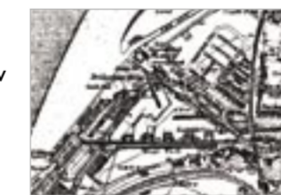
Runcorn Locks in 1905